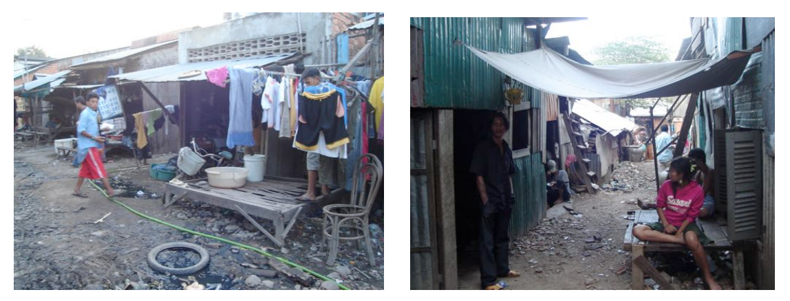
Street scenes from the Bird's Nest, behind the Building.

Homeless people in Phnom Penh slept at the Railway Station, sometimes with their children and even extended families. There is some daily rail traffic, but the train runs in each direction every other day. The train is slow and infrequent, so the overwhelming majority of travel occurs by road and boat. People lived and slept under the eaves where the railway workers would try to push them out, and on and under picnic tables owned by the bars and restaurants that serve the community of people living around the Railway Station. Single-story wooden buildings extend over Boeung Kak Lake behind the station, with one-room homes along walkways extending behind each bar, restaurant or pool hall between the tracks and the station itself. At night, sex workers of all genders stand outside the station looking for clients. Many more women who are sex workers work in the Garden of the Royal Palace at night.