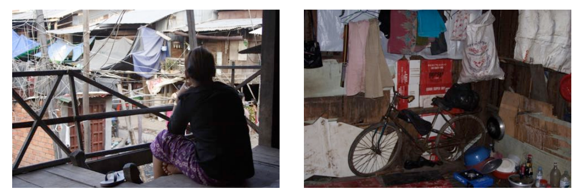
Homes in the Bird's Nest, behind the Building.

"The Building" is a specific concrete multi-story building in Phnom Penh, and there is a shantytown behind it. This is sometimes called "the Building area" or "the Bird's Nest". This is where many of the sex workers who seek clients in the Garden of the Royal Palace live. The area is overcrowded and lacks running water and sewers.