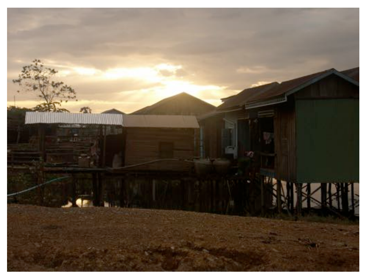
Homes in Svay Pak, December 2005.

concrete factories and hotels to wood and rattan houses on stilts, over a lake in which some people grow snails for the restaurants of Phnom Penh. Svay Pak is known for the number of sex workers there, many of whom are ethnically Vietnamese. Svay Pak received media coverage for the presence of children selling sex there. There are many brothels featuring groups of women alongside smaller buildings and women working out of their homes.