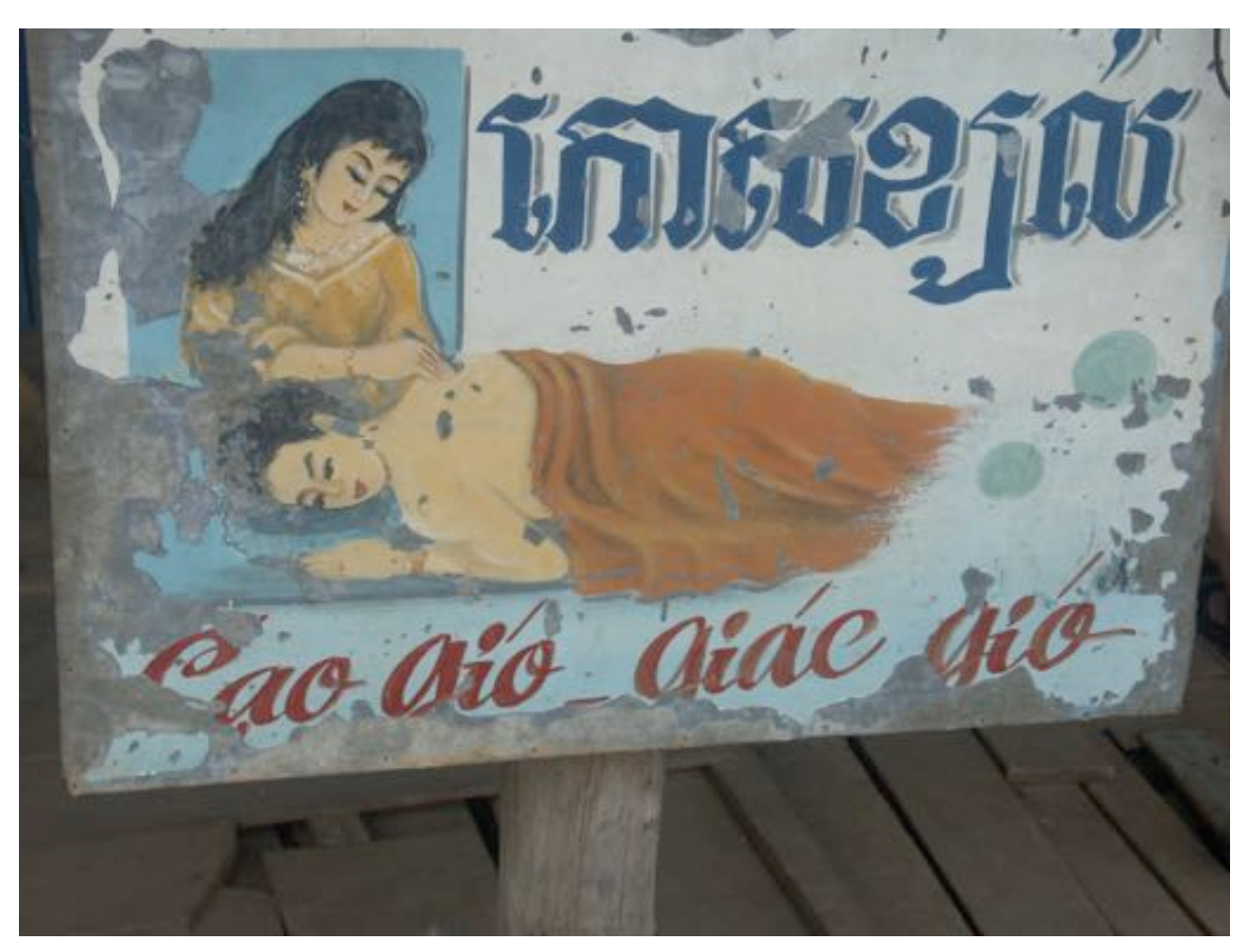
Massage signboard.

One brothel in a rural area was also the local store. It was entirely enclosed by a wire fence, with six small rooms that were rented to the women by the month. The owner and the women settled money together, and the women and the owner had organized a system to enforce condom use among the workers.