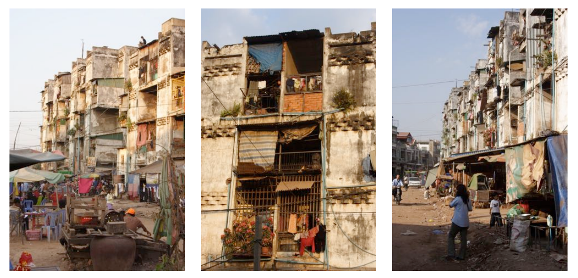
Exterior scenes of The Building, February 2006.

"The Building" is a specific concrete multi-story building in Phnom Penh, and there is a shantytown behind it. This is sometimes called "the Building area" or "the Bird's Nest". This is where many of the sex workers who seek clients in the Garden of the Royal Palace live. The area is overcrowded and lacks running water and sewers.