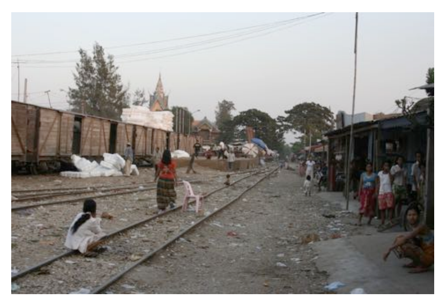
Brothel district, Sisophon.

The brothels visited were usually made of wood, with as many as six rooms inside, each furnished with a bed and many had satin sheets. Some rooms were decorated with safe sex posters and pictures from magazines. Walls were made of wood, rattan or cardboard. Many poor areas lacked running water, and the brothels within them also had no running water. Clients at the brothels were generally quick and did not linger.