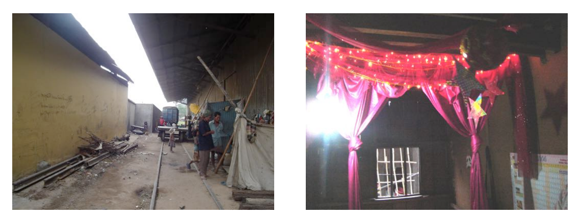
Residences at the Railway Station, Phnom Penh.

Homeless people in Phnom Penh slept at the Railway Station, sometimes with their children and even extended families. There is some daily rail traffic, but the train runs in each direction every other day. The train is slow and infrequent, so the overwhelming majority of travel occurs by road and boat. People lived and slept under the eaves where the railway workers would try to push them out, and on and under picnic tables owned by the bars and restaurants that serve the community of people living around the Railway Station. Single-story wooden buildings extend over Boeung Kak Lake behind the station, with one-room homes along walkways extending behind each bar, restaurant or pool hall between the tracks and the station itself. At night, sex workers of all genders stand outside the station looking for clients. Many more women who are sex workers work in the Garden of the Royal Palace at night.