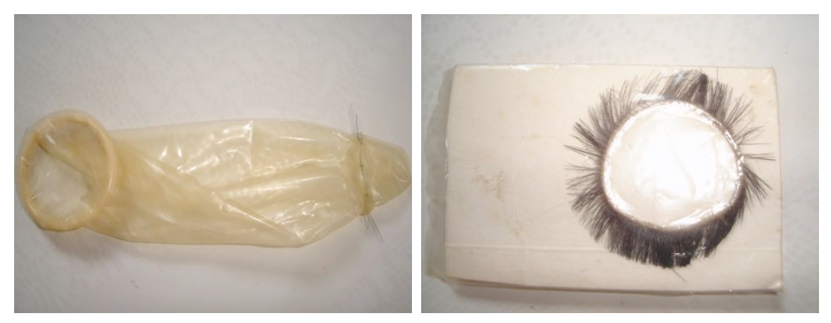
Condom and ring with bristles attached.

The most hated of these are the "tiger's mustache" condoms and rings, because the attached bristles are sharp and numerous.