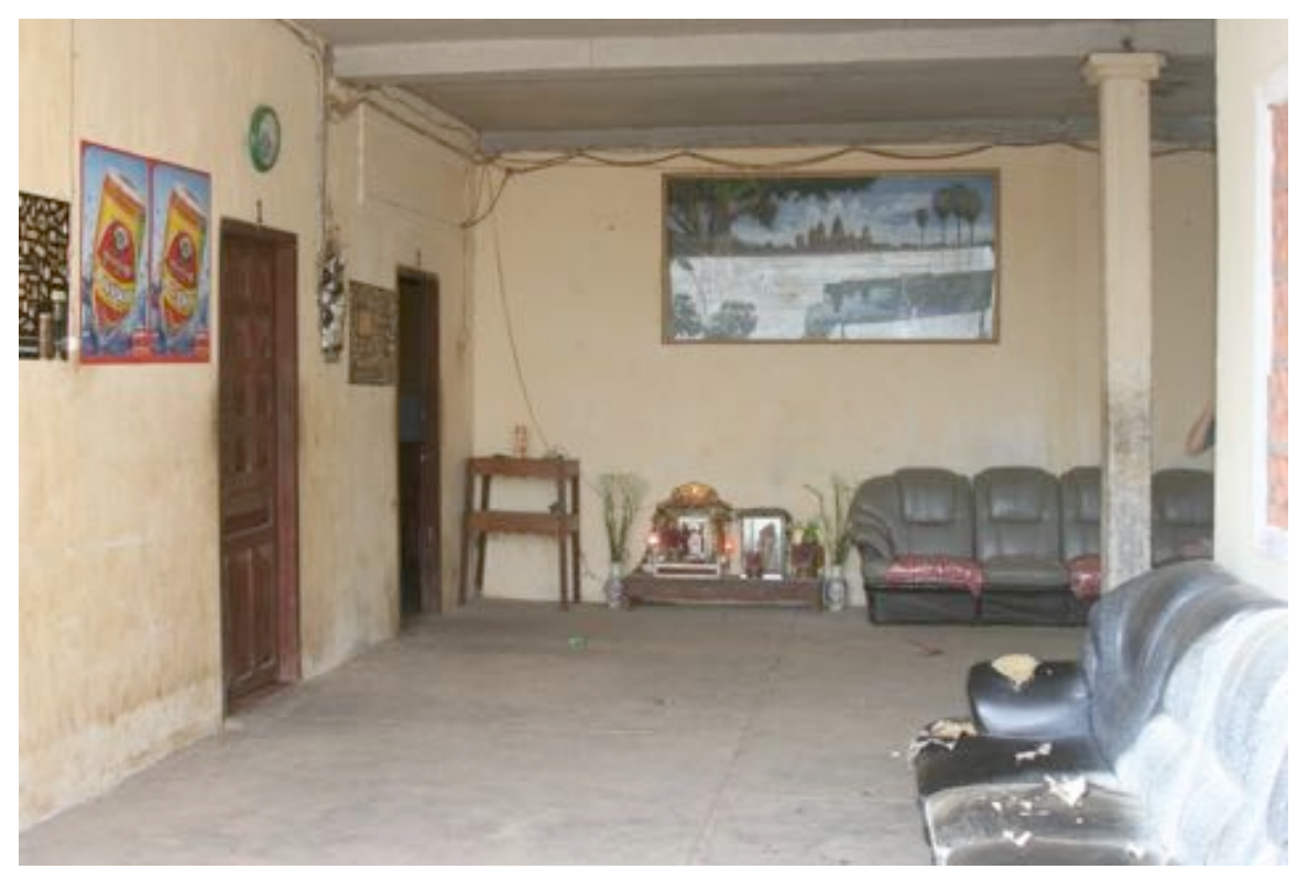
Karaoke bar.

Karaoke bars are places where men gather to eat, drink and sing, usually with karaoke hostesses. The hostesses generally live on the premises, and are usually paid a small amount, between ten and fifteen dollars per month, as well room and board. In addition to the small salary, they earn money via prostitution on the premises of the bar.