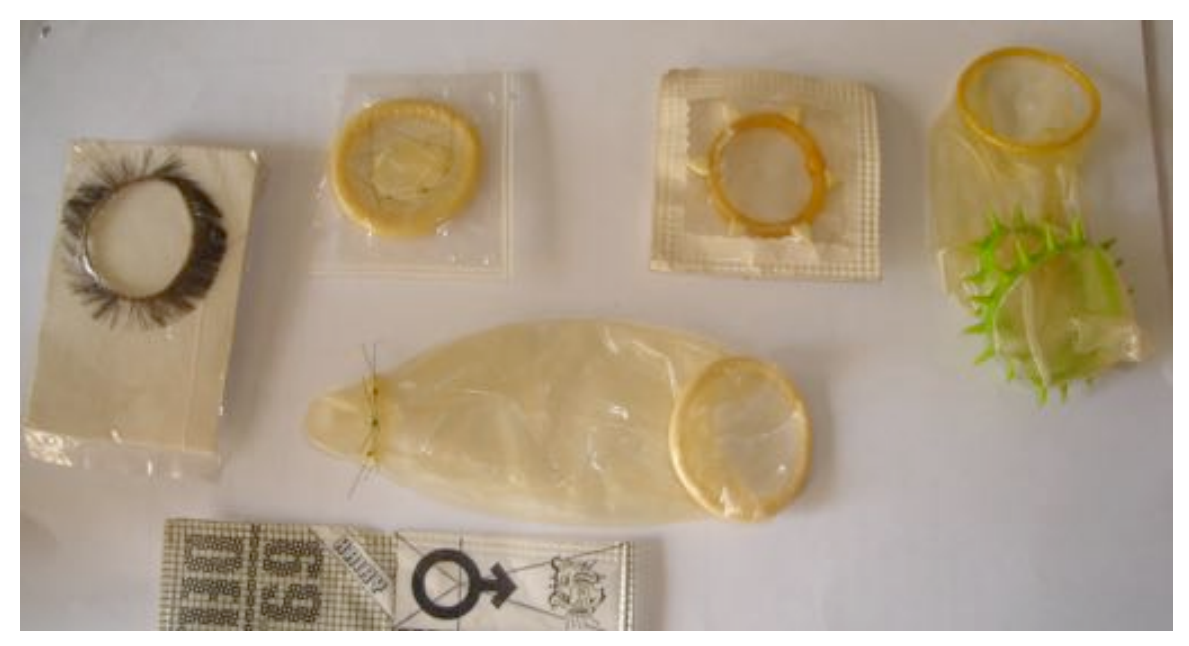
Unsafe condoms.

The most hated of these are the "tiger's mustache" condoms and rings, because the attached bristles are sharp and numerous.