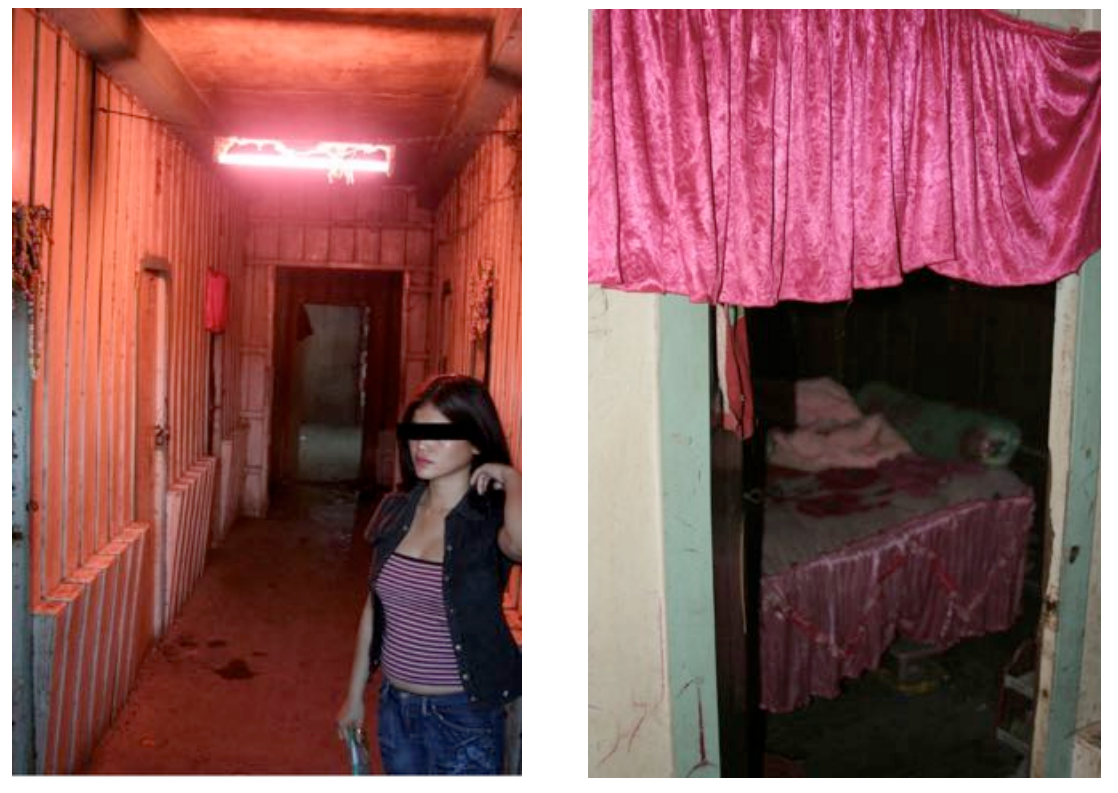
Brothel interiors, Sisophon.

The brothels visited were usually made of wood, with as many as six rooms inside, each furnished with a bed and many had satin sheets. Some rooms were decorated with safe sex posters and pictures from magazines. Walls were made of wood, rattan or cardboard. Many poor areas lacked running water, and the brothels within them also had no running water. Clients at the brothels were generally quick and did not linger.