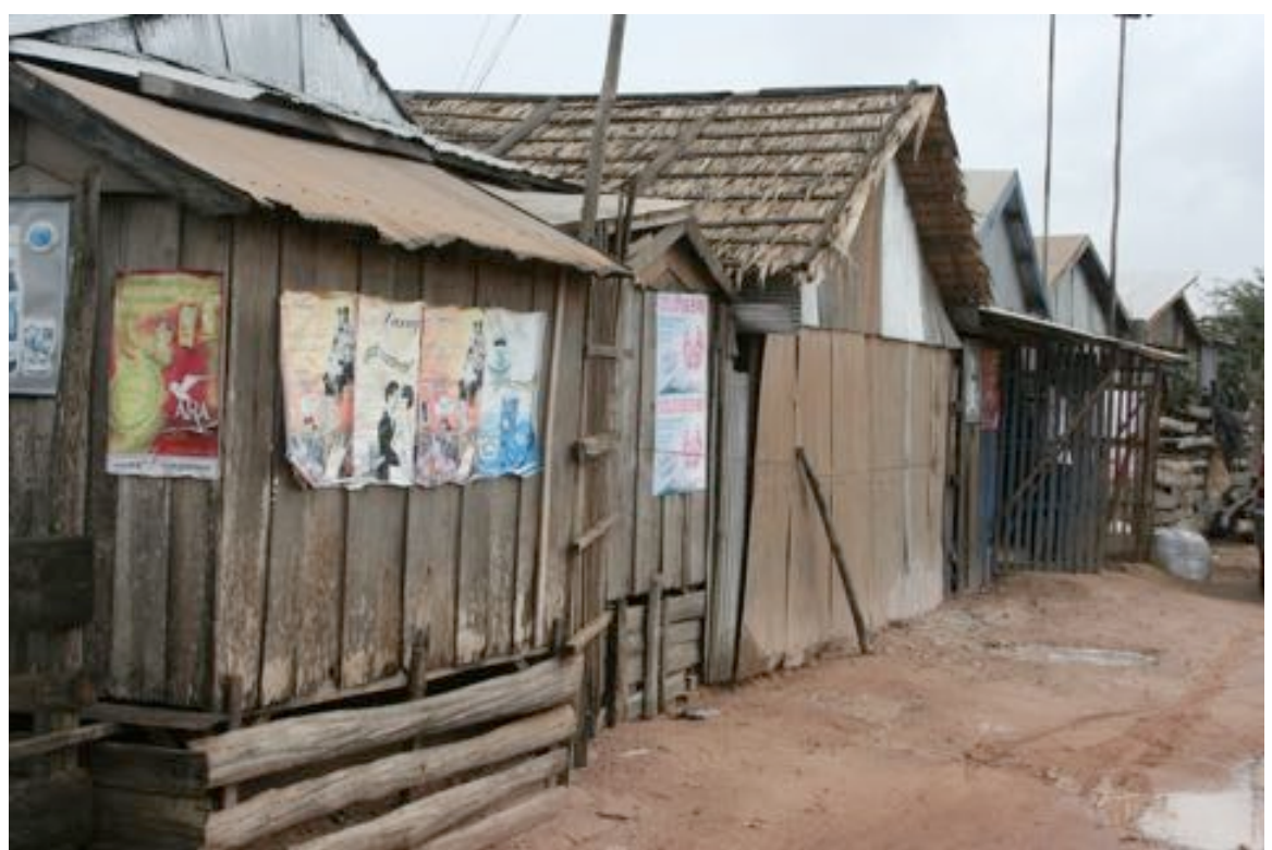
General store and brothel exterior, Krakor.

A different kind of brothel in one provincial area was also the local general store. The brothel and shop were entirely fenced in and had a wooden floor throughout. The general store sold laundry powder, milk, and other household goods alongside condoms. There was an area where people sat and drink beer. There was one large roof over everything, and then smaller huts under this roof. Each sex worker rented her own separate hut within the compound.