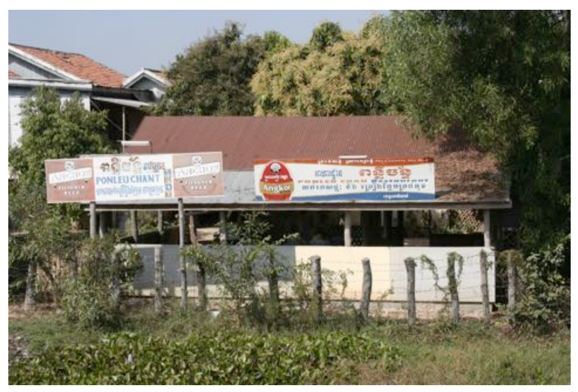
Karaoke bar exterior.

Beer companies and bars hire women to sell their beer in the bars and restaurants. Each brand available will have at least one beer girl to sell their beer. The women typically wear minidress uniforms with the brand name and logo. Beer girls are sometimes touched by bar patrons but sex is not expected. The beer girls are paid by the beer companies. They earn approximately $50 per month. Some beer girls supplement their incomes with prostitution with the bar patrons. This does not usually take place on the premises but in a guesthouse or hotel nearby.