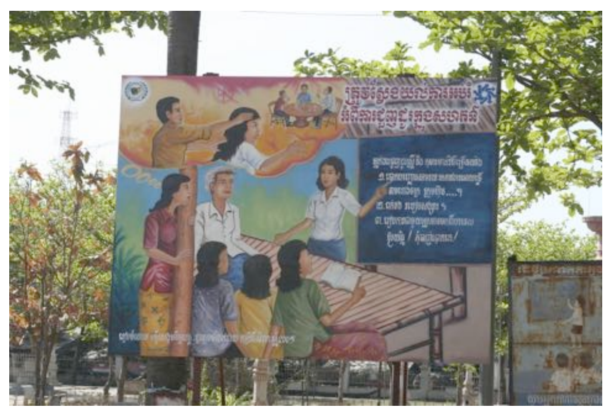
Billboard with an anti-trafficking message.