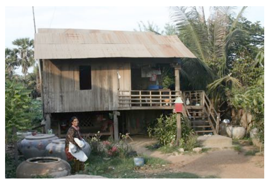
Five room boarding house in Pursat.

A rooming house in Pursat had one sex worker in residence in January, but had many more when UN soldiers were in the country. Other residents have included soldiers and migrants. This was a typical teak house, on a lake, with space underneath for a hammock and large clay water jars outside. Renting a room was described as typical for independent or freelance sex workers in this small city, with a few bars and restaurants and karaoke bars just outside town.