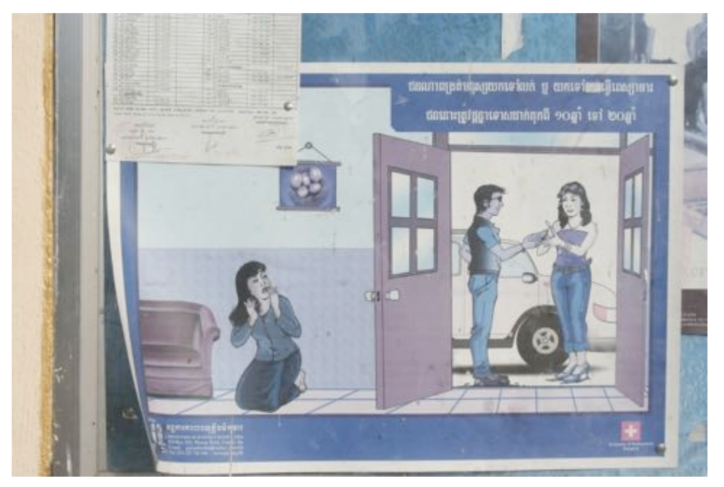
Billboard with an anti-trafficking message.